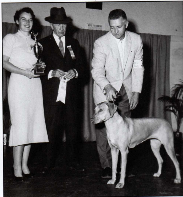
BEST OF OPPOSITE TO BEST IN MATCH - RHANI OF SWAHILI