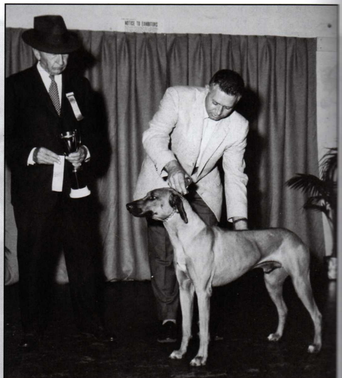
LAMARDE PERRO BOTHA