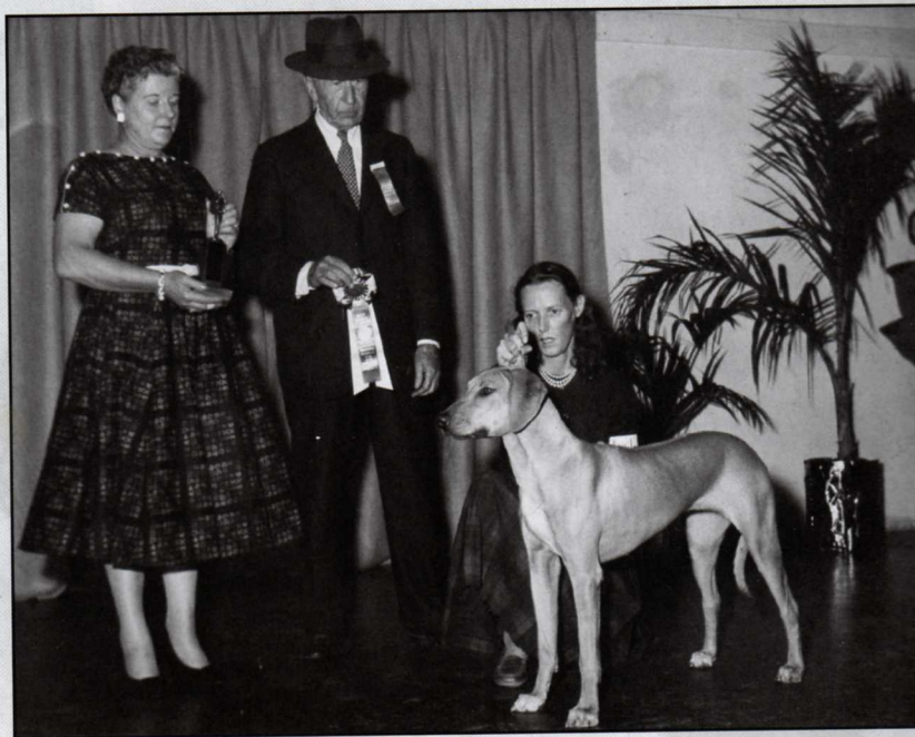
BEST PUPPY - LAMARDE PERRO DISA