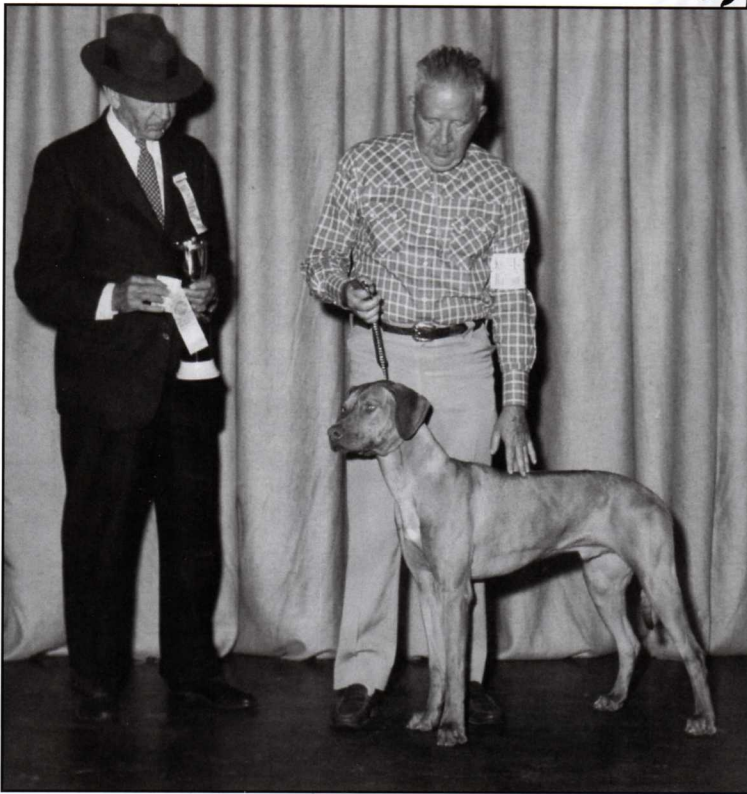
LAMARDE PERRO CHUPA